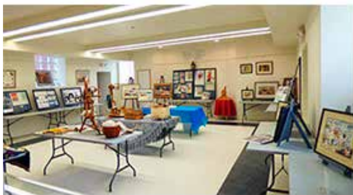
Social Hall with an Exhibit

Twenty year ago, people driving past a red brick building located on the east corner of 5th Street and 4th Avenue North in Virginia, MN, either ignored it, or viewed it as yet another abandoned piece of property. Perhaps some recalled that it was a synagogue, B'nai Abraham, erected by the city's once populous Jewish community, but few knew that when it was dedicated in 1910, the local newspaper hailed it as the "the most beautiful church (sic) on the Iron Range." Over the ensuing years, the synagogue's congregants experienced the same ups and downs as others on the Range. As opportunities dwindled their children moved away, and while they aged in place, their numbers too diminished to the point where they could no longer maintain their beautiful building. However, its historic and architectural importance did not go unnoticed, and in the 1980s it was placed on the National Register of Historic Places, the only synagogue in Minnesota to be so honored.