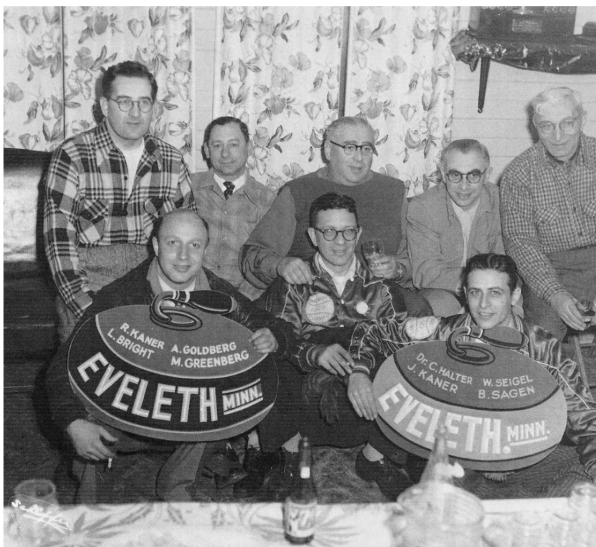
The Eveleth Jewish Men's Curling Team,