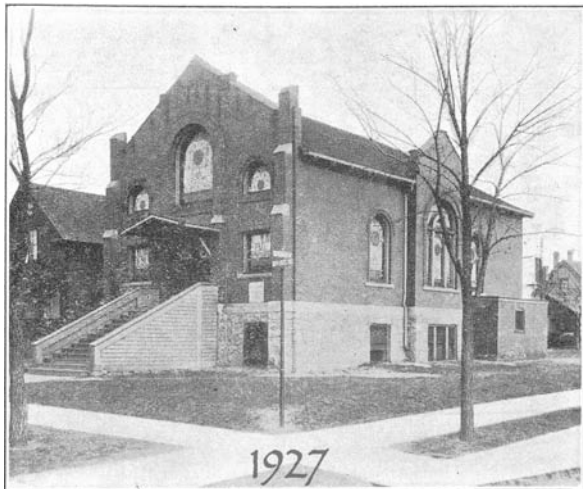
B'nai Abraham Synagogue

In the last decades of the nineteenth century, as Jewish settlers moved westward with the frontier, they brought in their 'baggage' their religious beliefs and traditions. It would not have been difficult for them to leave this 'baggage' behind and begin life anew in the New World bereft of the faith that caused them so much hardship in the Old World. The wonder is that the vast majority of Jewish immigrants chose to retain their Jewish identity in a country where they could have easily been lost in the crowd. This retention of Jewish identity and tradition in a remote frontier location is what the preservation of B'nai Abraham Synagogue celebrates.