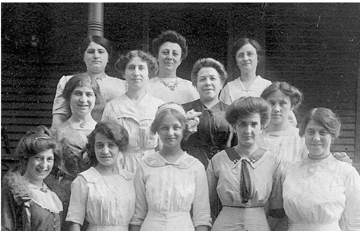
The Sunshine Club (Ladies Aid Society) early 1900s

Friends of B'nai Abraham, 1788 Maryland Ave. North, Golden Valley, MN 55427