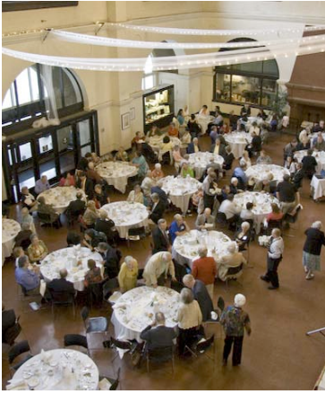
Culture and Cuisine evening