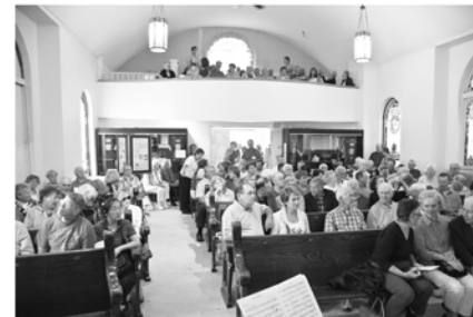
community reuse during restoration in 2009

For more information go to: www.IronRangeJewishHeritage.org Please help continue the resoration and provide for the future of B'nai Abraham. Click on the web site's "HOW YOU CAN HELP" link.