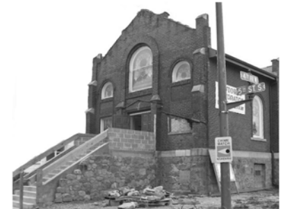
mid-restoration spring of 2010